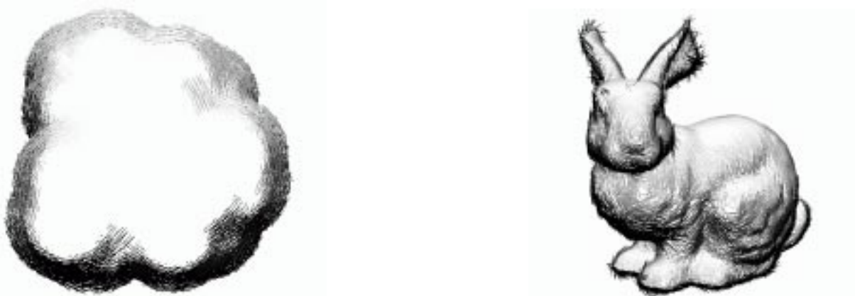
Figure 4: Two very different effects with a somewhat pencil-sketch-like feel. On the left, Molecule drawn with hatching silhouette strokes. On the right, Bunny drawn with very thin, elongated strokes roughly aligned.

On the left, particles were simplified in stage 1 to moderate density, and removed from non-silhouette regions. In stage 3, the surface normal was transformed into screen-space for use as an orientation vector. Stage 4 rendered the strokes with a hatching texture consisting of several horizontal lines, oriented by the transformed normal to appear tangent to the surface.