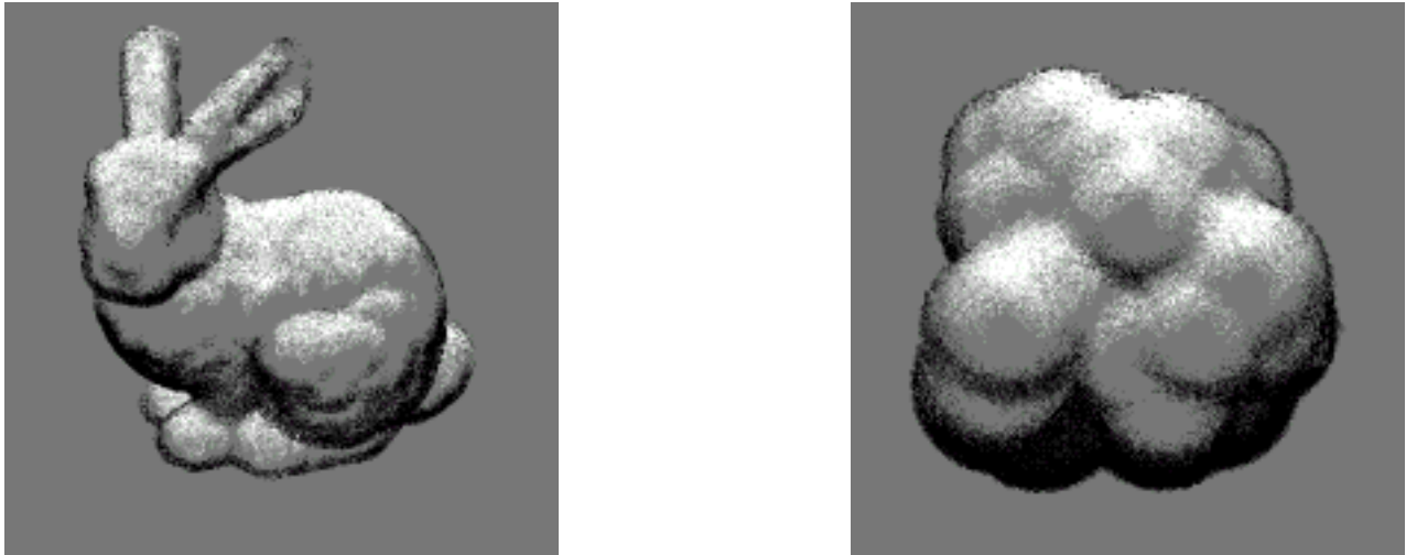
Figure 7: A two-tone effect in which light and dark strokes are drawn on a neutral gray background.

Following an image in [4], these two images use dark and light strokes to bring shape out of a neutral background. Stage 1 does not appreciably simplify the particle tree. In stage 2, the underlying polygons are rasterized to the depth buffer but not the color buffer. Stage 3 transforms and lights the particles. Stage 4 examines the intensity of the lit particles in the feedback buffer. Particles over an upper intensity threshold are rendered as solid white strokes, while particles below a lower threshold are rendered as solid black strokes. All other particles are discarded.