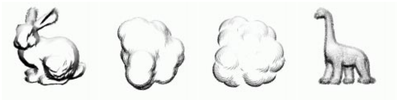
Figure 1: Several examples of different styles that can be created in our interactive NPR system. From left to right: an artsy bunny, an informal sketched molecule, a stylized molecule, and a fuzzy dinosaur.