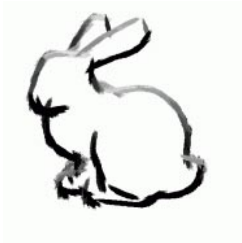
Figure 6: A charcoal effect using just a few strong overlapping silhouette strokes.

Here the particle tree was simplified drastically in stage 1, leaving only a few particles near the silhouette. These particles were transformed and lit in stage 3, along with an orientation vector aligned with the surface normal. The effect was completed by rendering with long, thick brushstrokes in stage 4.