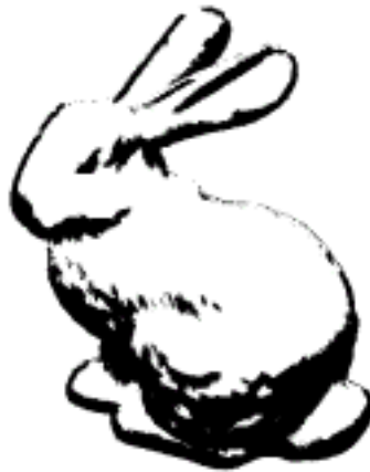
Figure 8: An India-ink effect using only strong, black strokes densely placed in regions of darkness.

This impressive effect is very similar to the two-tone effect described above, but uses only black strokes on a white background. Stage 1 does not simplify the model at all, so the particle tree is very densely represented. Stage 3 transforms and lights the particles. In stage 4, particles below a threshold intensity are rendered as solid black strokes; other particles are ignored. The thickly placed strokes create solid black regions for a strong, stylized effect.