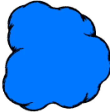
Figure 5: A cartoon drawing effect with solid interior shading and strong silhouette strokes.

In stage 1, particles not on the silhouette were simplified. Stage 2 rendered the underlying triangles a solid color, with flat shading and lighting disabled. Stage 3 transformed the particles and the surface normal into screen space, but did not perform any lighting calculations. Stage 4 rendered those particles lying exactly on the silhouette with strong black horizontal strokes, aligned by the transformed normal to appear roughly tangent to the surface.