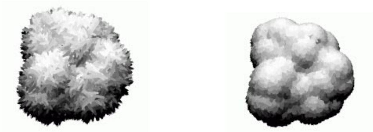
Figure 3: On the left, a painterly rendering of Molecule with long, thin strokes. On the right, the same model rendered with round, dabbed strokes. For these renderings: