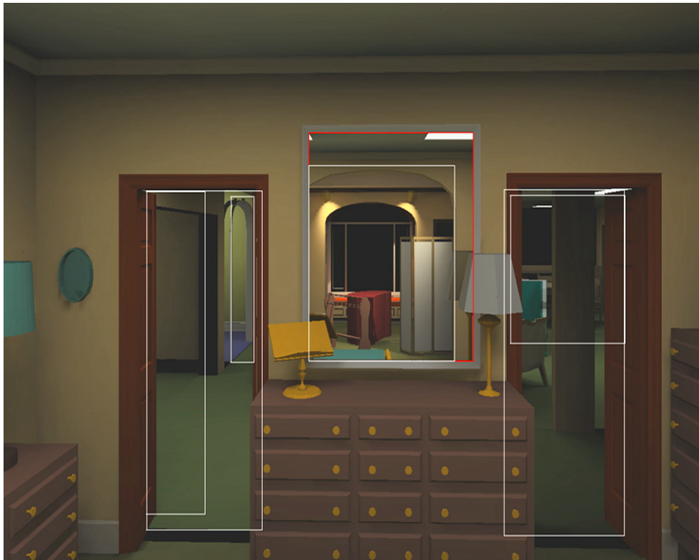
Plate 1. View from the master bedroom of the Brooks House showing cull boxes for portals (white) and mirrors (red).